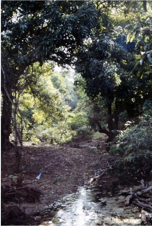
Figure 4. Typical mango plantation, habitat of M. viridis .