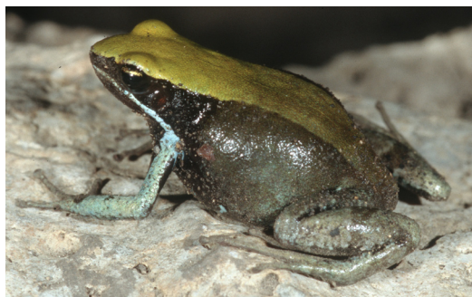
Figure 3. Individual from Montagne des Français with colour traits intermediate between Mantella viridis and M. eburnei .

Seen the actual wide distribution of M. viridis in the considered area, and some populations appear to be locally abundant, the status of this species needs to be re-evaluated. This should be done within the framework of the Global Amphibian Assessment (Andreone et al., 2005), in order to draw new and updated conservation strategies.