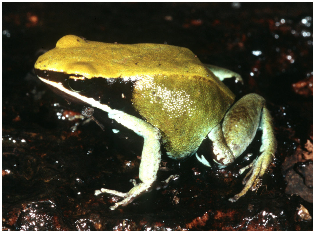
Figure 2. Mantella viridis from Antongombato with green colouration.

This adaptability allows the colonization of secondary and degraded habitats as well as human perturbed areas. Examples of this are the populations found within the Antongombato region (inside the homonymous village) and the populations of Malema and Lamerouge, which live within the draining channels along the road. In such a context the elective habitat is represented by mango plantations with irrigation ditches where large populations of M. viridis have been found. We assume