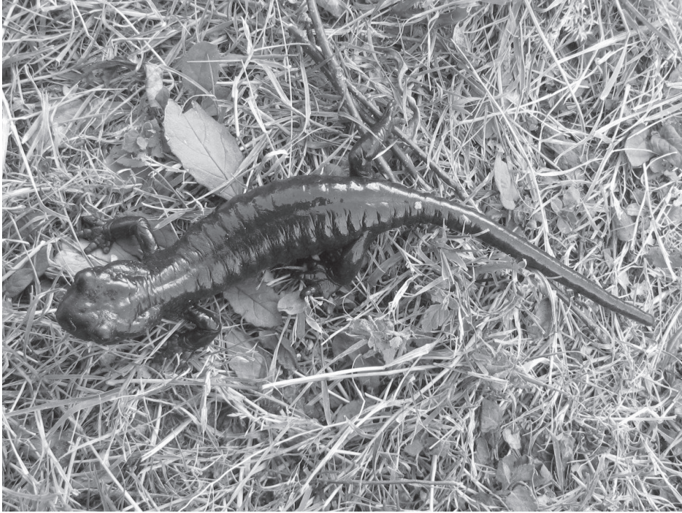
Fig. 1. The female of Salamandra lanzai , photographed in the Upper Sangone Valley.

at 94 °C for 45 s, annealing at 55 °C for 45 s and extension at 72 °C for 90 s, and a final extension of 300 s at 72 °C. PCR products were loaded onto 1% agarose gels, stained with ethidium bromide, and visualised on a “Gel Doc” system (PeqLab). If results were satisfying, products were purified using QIAquick spin columns (Qiagen). The light strands were sequenced using an ABI3730XL by Macrogen Inc. (sequences GenBank accession numbers: EF191028- EF191041). Sequences were manually edited and aligned using the BioEdit sequence alignment editor (version 7.0.5, Hall, 1999).